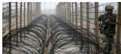
Figure 3: http://zeenews.india.com/news/india/india-says-border-disputes-only-with-china-pakistan_1830251.html