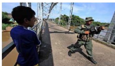
Figure 2. Venezuelan troops close the Venezuela-Colombia border in Boca de Grita, Tachira state, on August 21, 2015

India and Pakistan distribute a border having different class like working boundary, Line of Control, Line of